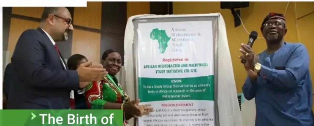
Official unveiling of AHMSG